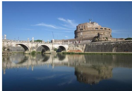
Castel Sant'Angelo, Rome