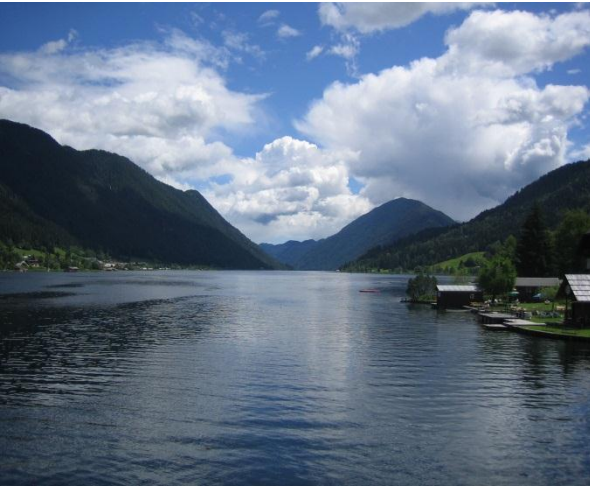
Fig. 1: Weißensee at an altitude of 930 m in the Gailtal Alps [Gailtaler Alpen]

The 16 th UNGEGN Working Group on Exonyms Meeting will take place 5-7 th June 2014 in Hermagor , in the southwestern part of Carinthia, Austria. The first 2 days of the meeting will be dedicated to paper presentations and discussions. On Saturday, 7 June 2014, there will be a common excursion to a picturesque mountain lake (Weißensee) (see Fig. 1).